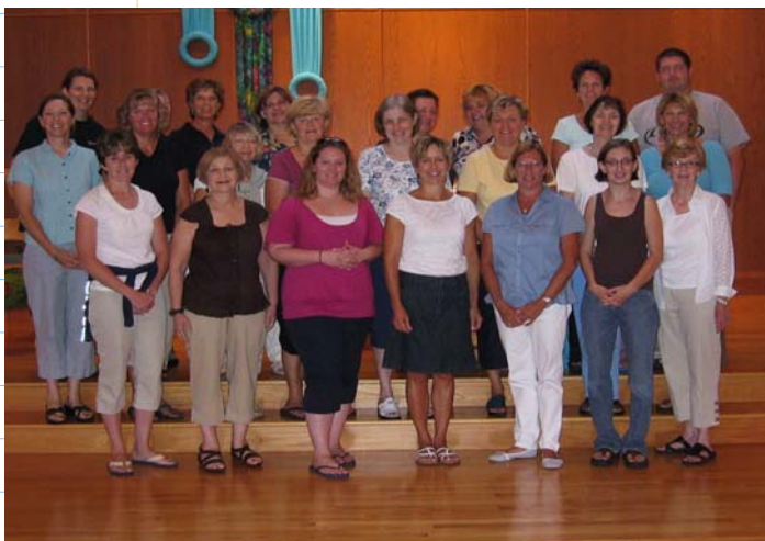
The Incarnation Faculty/Staff 2009—2010

Set up a consistent place for your children to do their homework each day. Make sure the area is free from unnecessary distraction, has the supplies needed to complete the assignments, and also be on hand to answer questions.