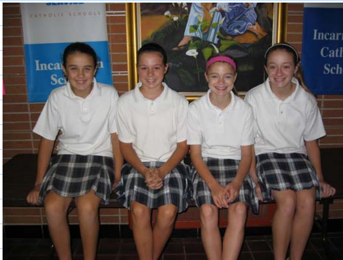
2009—2010 Incarnation School Student Council Officers